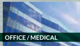
OFFICE / MEDICAL

To qualify as a “like-kind” property for a §1031 exchange the investor's relinquished property and replacement properties must be property that has been and will be held for productive use in the investor's trade or business or for investment.